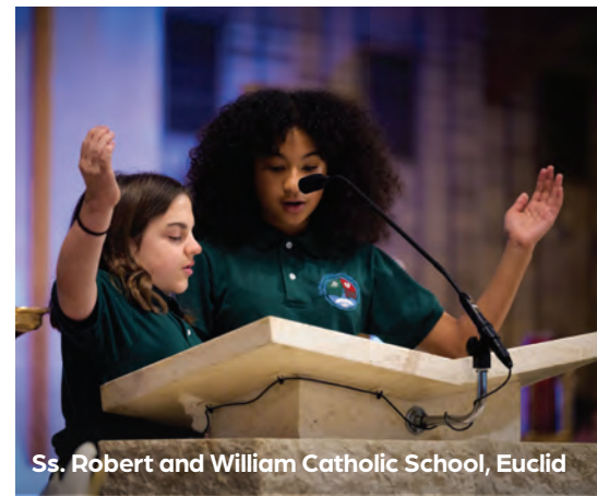
Ss. Robert and William Catholic School, Euclid