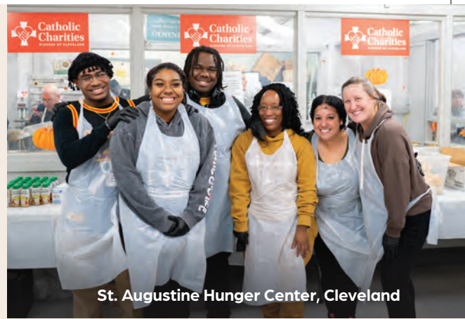
St. Augustine Hunger Center, Cleveland

Strong parish communities are the heart of our diocese, and essential for the life of the Church. They nurture faith, support families, and become schools of service and evangelization.