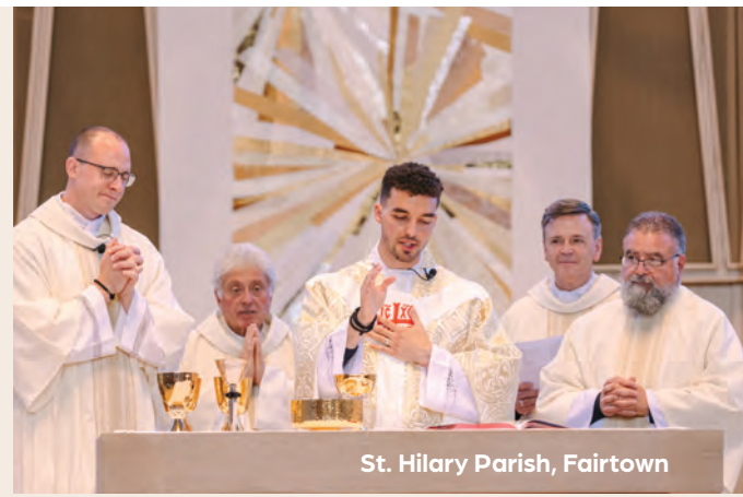
St. Hilary Parish, Fairtown