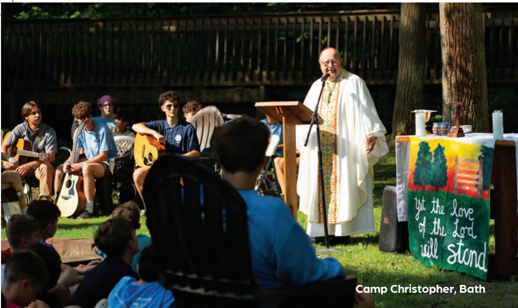
Camp Christopher, Bath

Since its founding in 1847, the Diocese of Cleveland has grown into a vibrant Church with 182 parishes, 108 schools, and one of the nation's largest Catholic Charities organizations. Today, we are called to once again help our Church flourish by strengthening our parishes, schools, ministries, and communities.