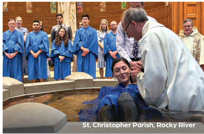
St. Christopher Parish, Rocky River